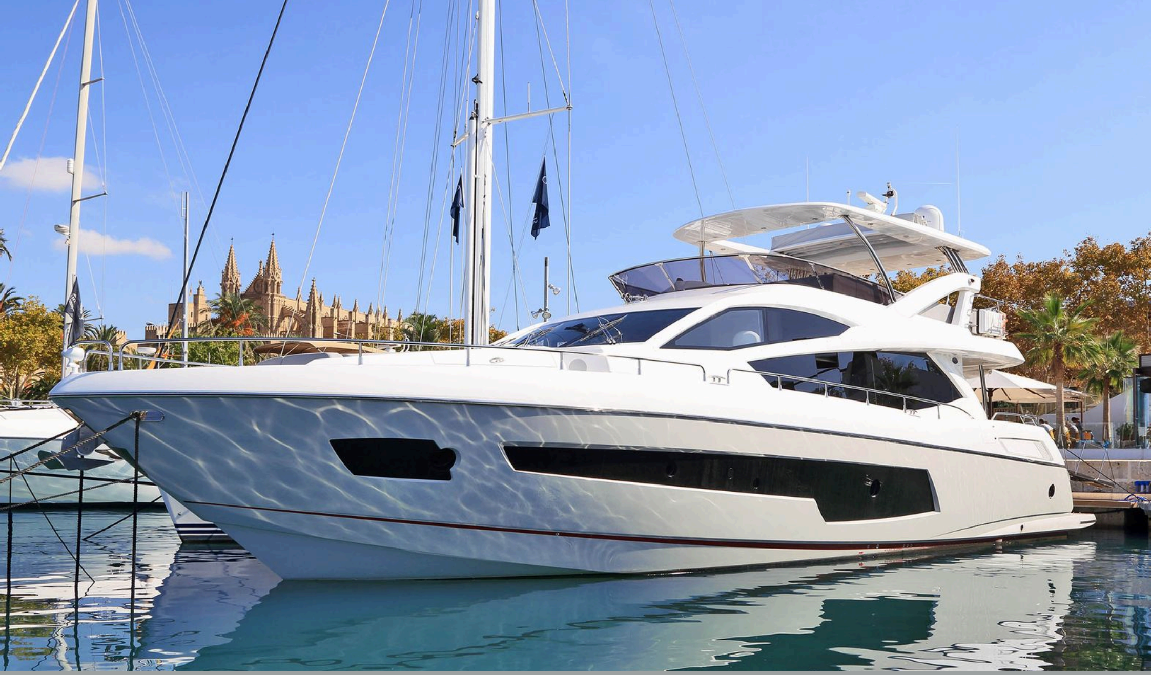
Sunseeker 75 Yacht - Raoul W